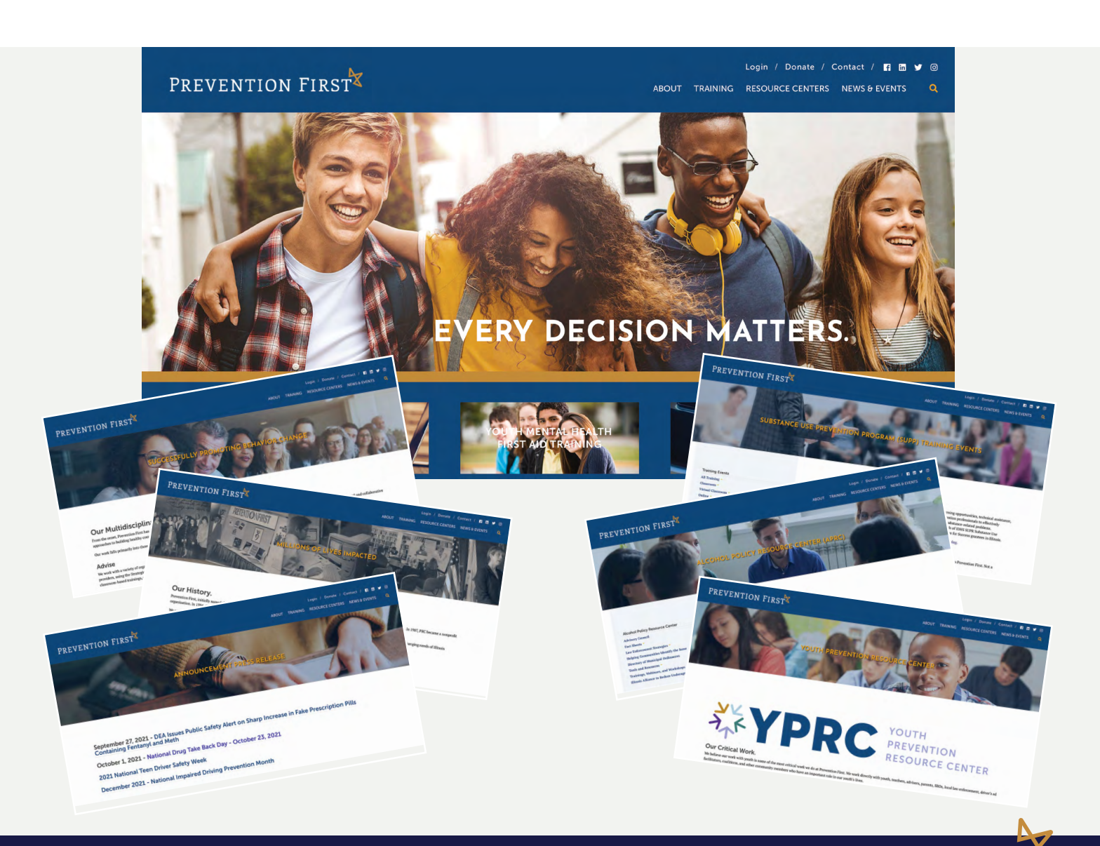
ADVISE. AMPLIFY. ADVOCATE.

This year, Prevention First rebranded to revitalize and refocus Prevention First's purpose and presence . This transformation helps to elevate our brand and unify our organization. While Prevention First has embraced a new look and feel, we remained true to our core identity throughout the process. You can now see our refreshed brand elements throughout our media channels and all publications.