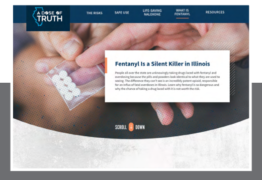
A Dose of Truth reaches audiences most at risk of illegal use of opioids providing information about the dangers of fentanyl and the life-saving tool, naloxone.

Our department ADVOCATED for healthy behaviors through four targeted public awareness campaigns. Each campaign used strategic messaging to reach over 393.3M impressions throughout Illinois.