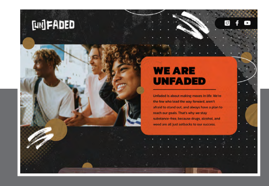
Unfaded is a public awareness campaign reaching youth at higher risk of polysubstance use with education and motivation to reduce or end the misuse of substances.

Let's Talk Cannabis Illinois targets adults 21 and over who are using cannabis with messages about safety and health-related to cannabis. The campaign also reaches out to pregnant and breastfeeding mothers providing education around cannabis use and the impact on their child.